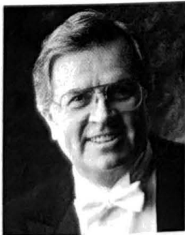
Donald Hunsberger Guest Conductor All-State Wind Ensemble